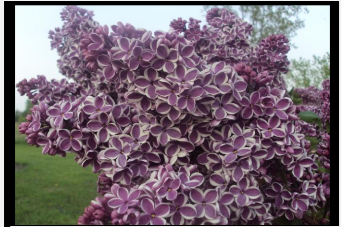
The bi colored lilac 'Sensation' is always popular!

This year's splendor of fall foliage is expected to be among the best in years due to more rain during this year's growing season. Already, because of the cool nights and reduced daylight, bright orange and yellow are brightening the landscape at Sunny Fields; the expected peak of best fall color in the park is usually about October 5 th -25 th , subject to the amounts of rain and wind. " Who has seen the wind? Neither I nor you, but when the tree is moving, the wind is passing thru. " --Anonymous (Who apparently wrote lots of poems!)