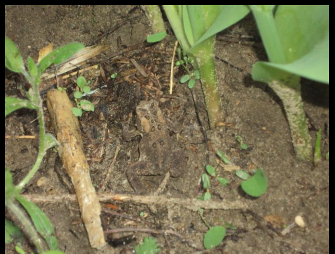
Can you find our native toad hunting by these tulips?

With the Lilac Festival fresh in our minds what better plant to feature than the common lilac? The common lilac is a native of Eastern Europe that has traveled throughout the world. Syringa vulgaris is the aristocrat of the lilac world with over a thousand different cultivars/varieties it has been refined for color, fragrance, size and is still being selected for tolerance to extreme climates. When you think of the smell of lilacs then you are thinking of common lilac. Plants range from dwarves at two foot of height to the original plants that easily top fifteen feet. The bark is typically gray on young plants and gradually transitions to brown and fibrous on older trunks. Most cultivars of common lilac will produce 'suckers' if conditions are right. To learn more about lilacs simply visit Sunny Fields, join the International Lilac Society or read several books that are loaded with information. The common lilac has caught the eye of famous hybridizers such as Lemoine, Kolesnikov, Havemeyer, Fiala, Fenicchia, Peterson, Alexander, Klager and so many more. AKA French Lilac and farmhouse lilac.