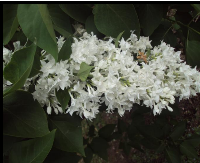
2012 Queen of the Lilacs was 'Beth' a double white.

On Friday, September 27 th at 6:00pm, Sunny Fields will host its Annual Meeting. If you are a member and receive this newsletter...then you are invited to attend. This meeting is a celebration of the end of the park season where the finances, goals, accomplishments and changes are conveyed to our supporters. As a non-profit this meeting is a requirement. We would like to see you all there and hear your ideas and suggestions for the future or things that we can improve right now. The park is open for members to explore and enjoy. Dinner and refreshments will be served at 6:30pm for attendees. If you plan on attending, please call the Sunny Fields park office at (810) 387-2765 to let us know how many guests will be attending. See you there!