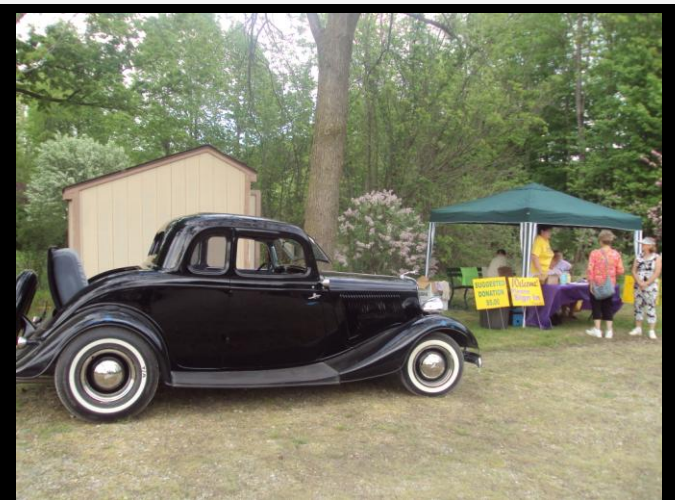
2013 Lilac Festival ...volunteers, lilacs and classic cars